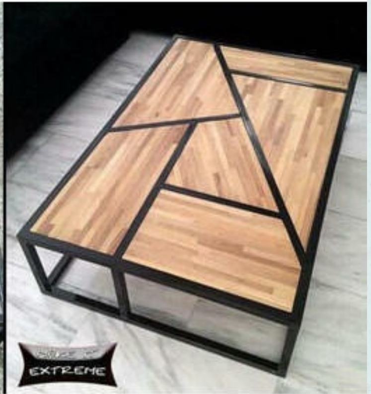
Mild Steel Designer Table