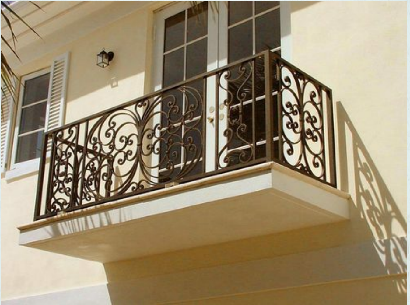
Mild Steel Balcony Grill