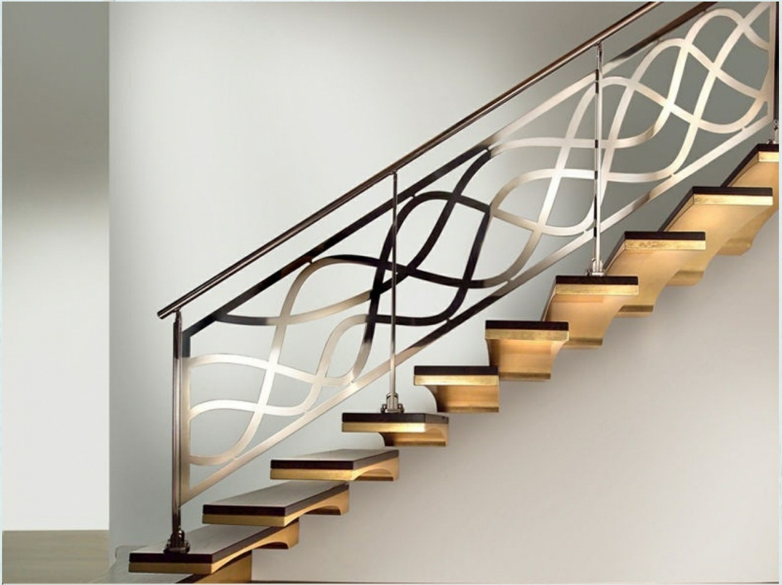
Mild- Steel Staircase Railings