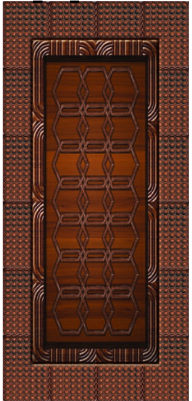
SB DD 227